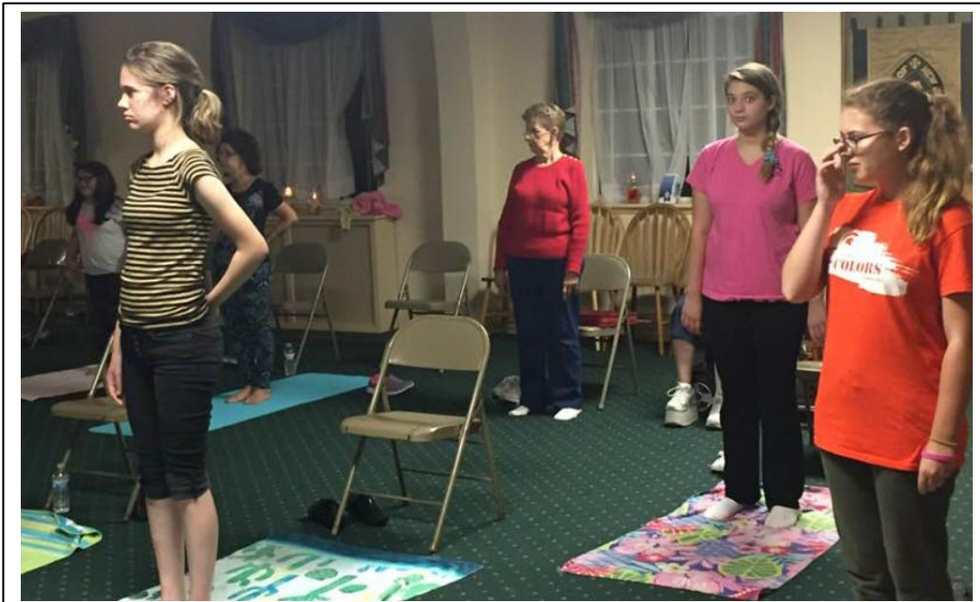
GFS Mercerville Yoga and Meditation Night October 2018