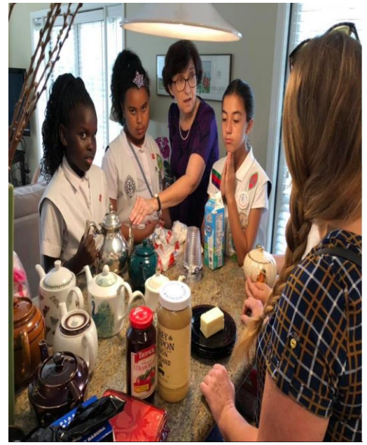
GFS Los Angeles serving tea at the United Thank Offering Tea at the Bishop's home. October 6, 2018.