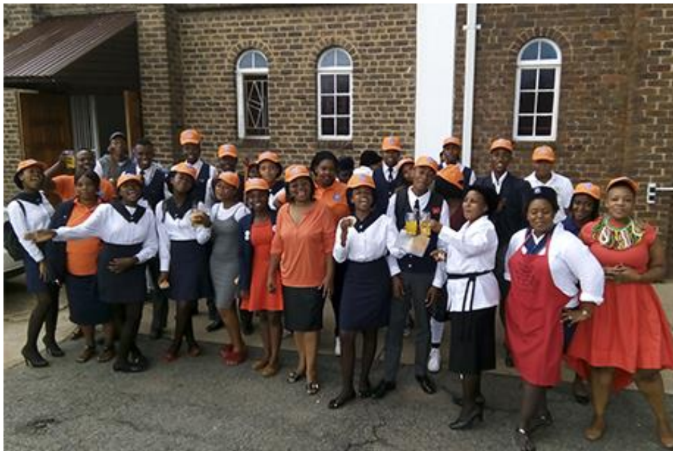
Photo: Young South African men and women from the Girls’ Friendly Society and Boy’s Friendly Society wear orange as part of their campaign against gender-based violence.