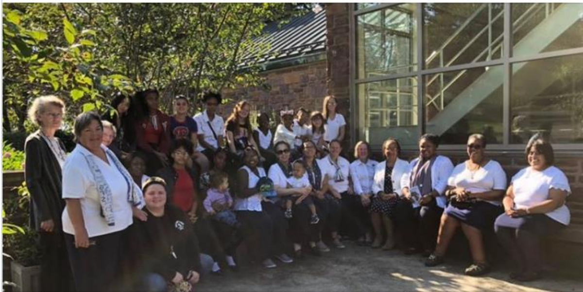
GFS Pa World Day of Prayer 2018