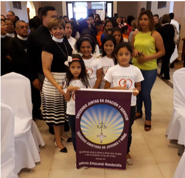
Welcome GFS Honduras. GFS is growing.